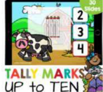
Farm Tally Marks: Counting 1-10 Kindergarten Math $3.00