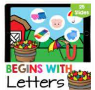
Apples: Begins With Alphabet Kindergarten Reading Google ... $3.00