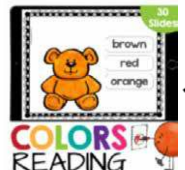
Reading Color Words Kindergarten Reading Google SI ... $3.00