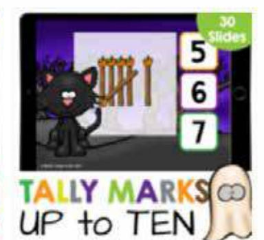
Halloween Tally Marks: Counting 1-10 Kindergarten Math ... $3.00