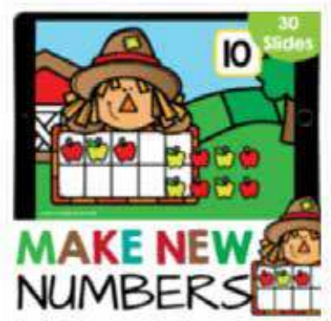
Apples Numbers with Ten Frames: Counting to 10 Kindergarten ... $3.00