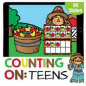
Apple Counting On Teens with Ten Frames: 11-20 Kindergarten ... $3.00

How Many to Make 10 with Apples Kindergarten Math Google ... $3.00