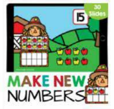
Apples Teen Numbers with Ten Frames: Counting to 20 ... $3.00